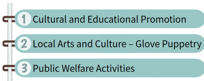
Figure 5-11 Sustainable Care

Puppet theater is a shared cultural heritage of Taiwan and a collective memory of its people. It is not only a treasure of local culture but also one of Taiwan's most distinctive cultural forms. Therefore, passing on positive values and educational culture is an unshirkable responsibility. "Puppet theater connects generations in Taiwan through a shared emotional bond with the land and embodies the spirit of Pili." Under the mission of preserving Taiwan's cultural arts, safeguarding its heritage, and deepening the understanding of local artistry, Pili strives to promote traditional puppet theater through an approach that combines education and entertainment. The goal is to help the public learn about its origins and development, and to carry forward this unique cultural tradition.