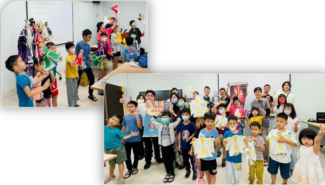
Figure 5-14 Fulfilling Cultural Heritage and Supporting Students in Learning Puppet Theater Art

PILI International is committed to cultural heritage and educational outreach, actively supporting students in learning the art of puppet theater. On August 10, 2025 , PILI hosted an interactive puppet theater event at the Taiping Pinglin Library Branch. Through captivating performances and hands-on workshops, children experienced the exquisite craftsmanship and manipulation techniques of traditional puppets up close, immersing themselves in the charm of this unique art form.