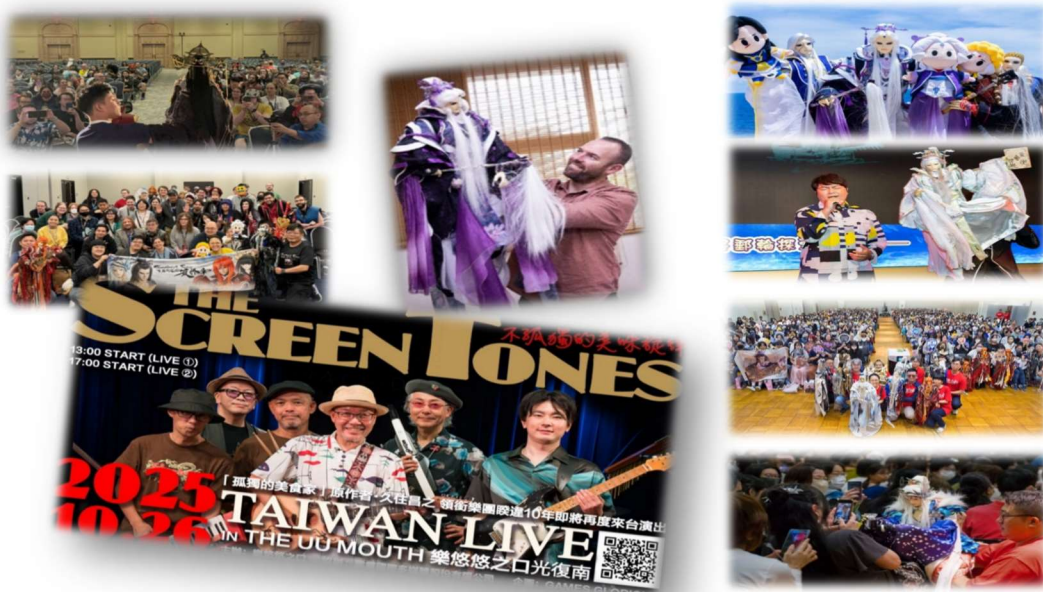
Figure 5-15 Cultural Heritage and International Exchange