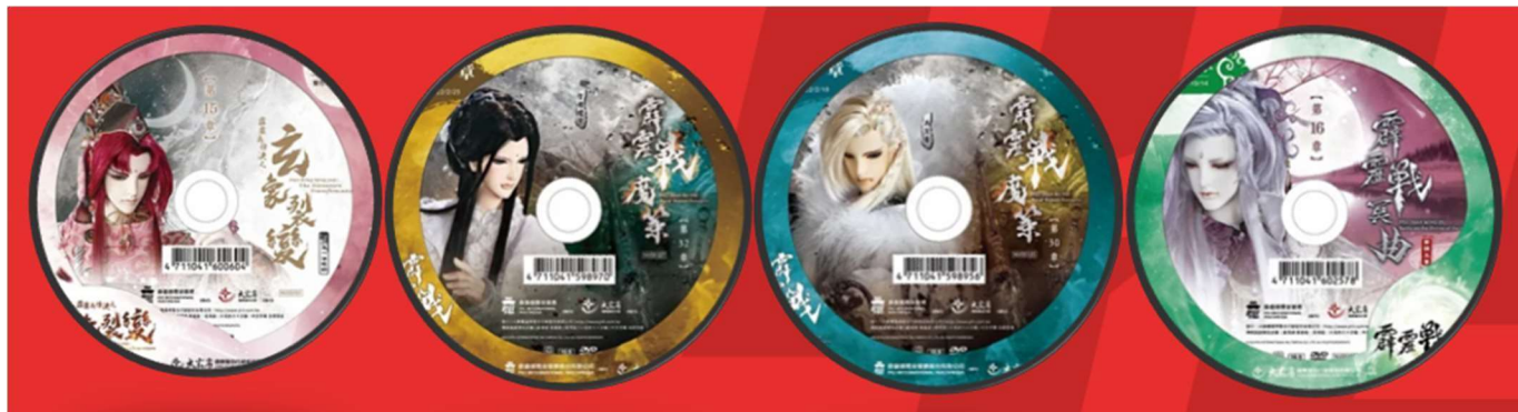
Figure 5-10 Community Harmony

Driven by the belief that consistent acts of goodwill create lasting impact, we remain committed to social engagement without complacency. By integrating diverse knowledge and collaborating with local community organizations and resource networks, we foster mutual learning and collective action. These efforts aim to gradually amplify the positive outcomes of regional sustainability and shared prosperity.