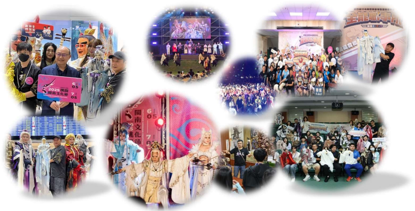
Figure 5-12 Education and Cultural Promotion

PILI International adheres to the philosophy of “Cultural Heritage, Innovation and Shared Prosperity” , continuously promoting puppet theater art education and cultural exchange. Leveraging its core strengths, PILI integrates traditional craftsmanship with modern creativity to advance cultural sustainability.