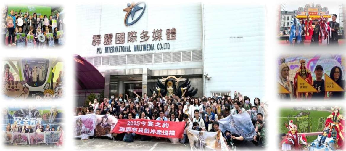
Figure 5-13 PILI Cultural and Artistic Heritage